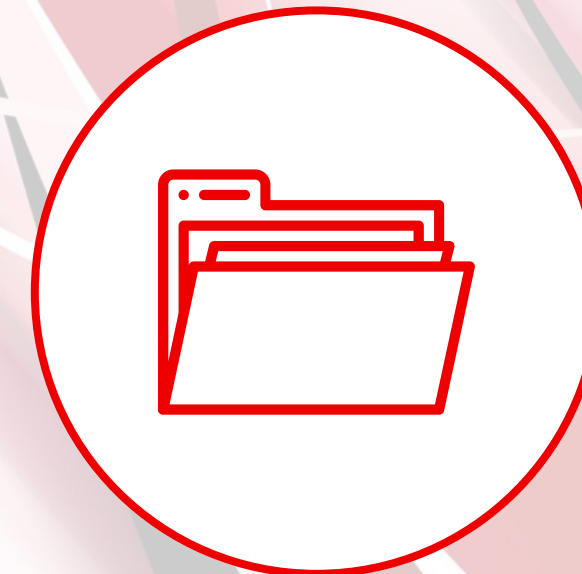
Final File Delivery (DST, PES, EMB)